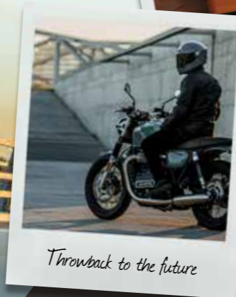
Throwback to the future