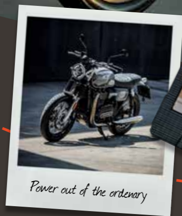
Power out of the ordinary