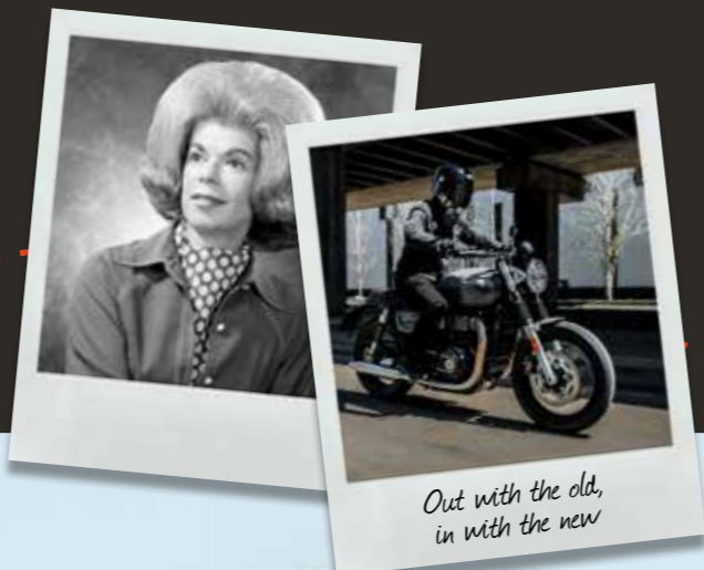
Out with the old, in with the new