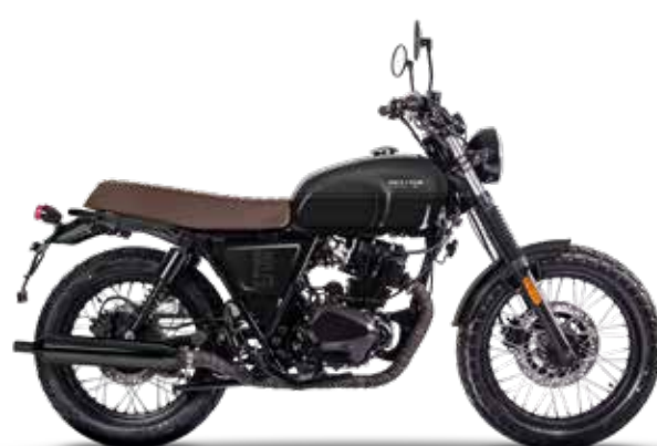
Backstage Black / Titan Black