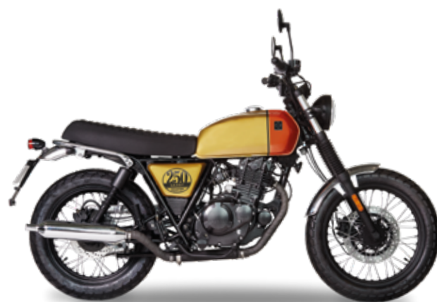
Desert Gold / Clockwork Orange