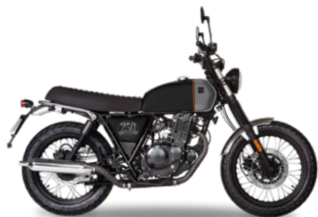
Backstage Black / Timberwolf Grey

*Preliminary data, final data may differ