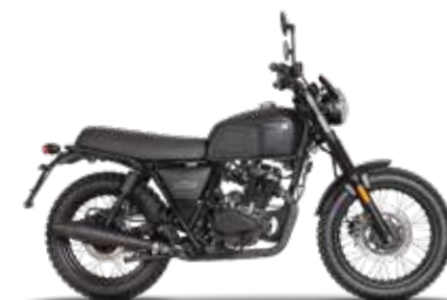
BX 125 X