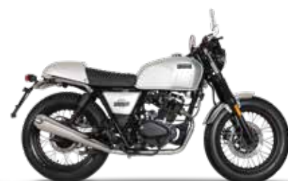
BX 125 R