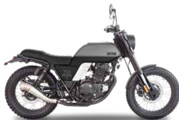
Backstage Black / Timberwolf Grey