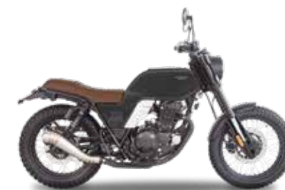
Glanville 250 X